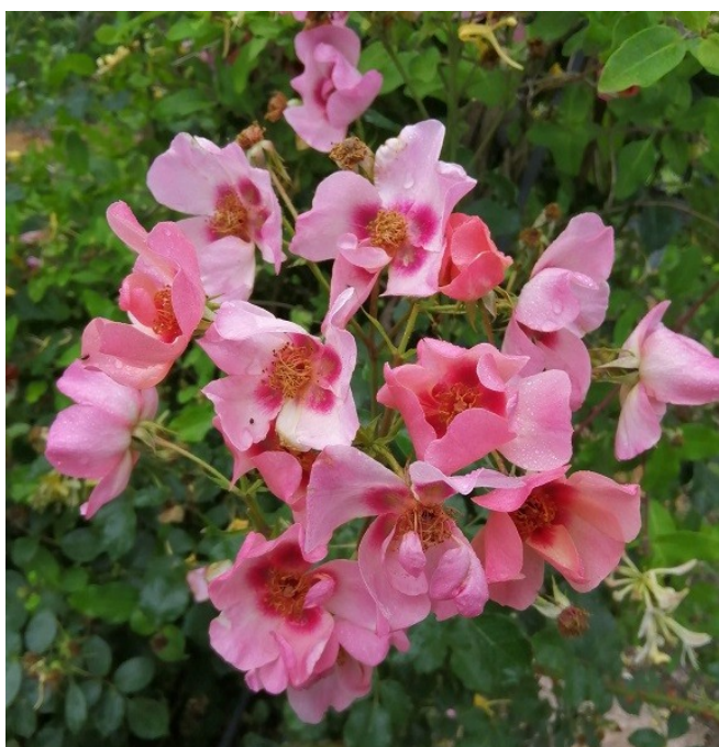
Rose "For Your Eyes Only"

Now that things are slowly coming back, we are venturing out on short trips. This afternoon we managed to book a garden visit to one of our local National Trust properties, Beningbrough Hall.